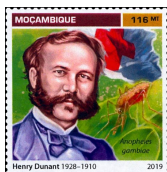
Dunant and Anopheles