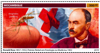
Sir Ronald Ross and Anopheles gambiae